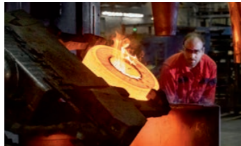
Metal production and processing